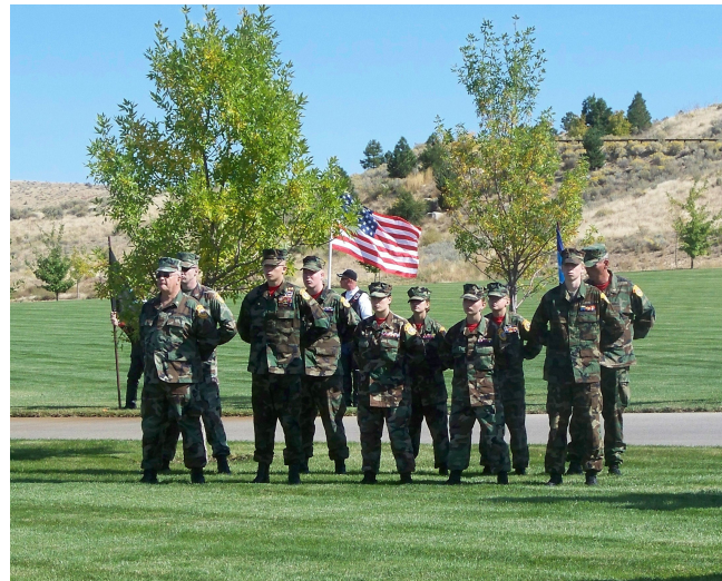
Oct 1 st Gem State Young Marine Detachment, standing tall for our Vietnam veteran Missing In Action for the past 43 years. Thanks Young Marines

Oct 1 st we again showed our respect by being at the Veterans Cemetery along with numerous other Veteran Organizations as well as our Gem State Young Marines. Thanks to all who showed up.....Semper Fi